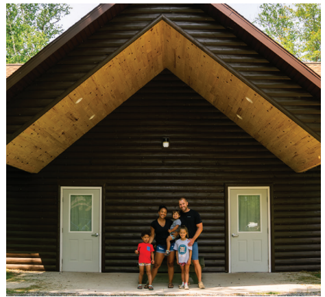
The Janssen family of Cherry Valley, IL, enjoyed their stay in Covenant Point's new Hemlock Lodge during family camp this summer.

Hemlock added 24 beds to Covenant Point's lodging options, increasing the camp's capacity to 234 beds. The next step in the project is to add covered porches and complete interior upgrades to Aspen and Birch lodges, which are adjacent to Hemlock. That work will be completed this fall and early winter. 🌿