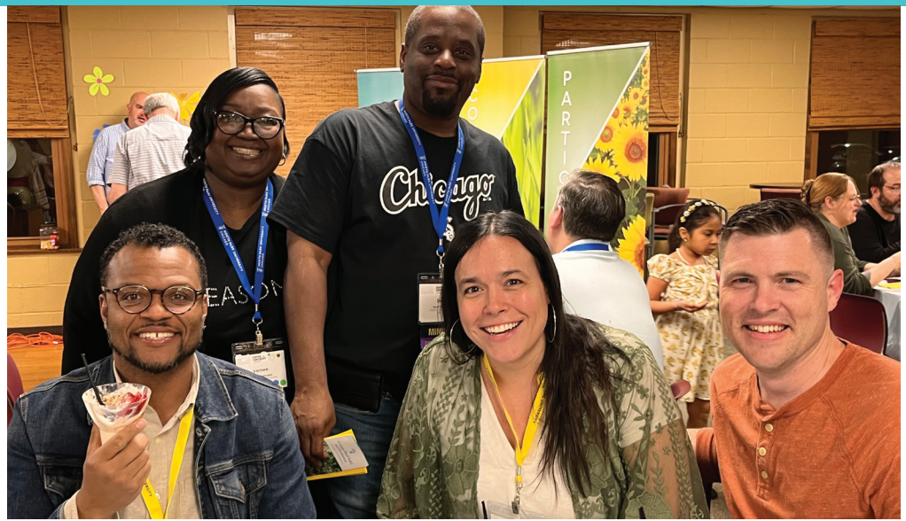
Covenant pastors enjoy ice cream during a celebration of camp ministry this spring.

Harbor Point Ministries honors and celebrates the lives of our friends and supporters and thanks the following donors for their contributions. Gifts recognized here have been received by Harbor Point Ministries, Covenant Harbor Bible Camp and Covenant Point Bible Camp between Aug. 16, 2023, and Sept. 15, 2024.